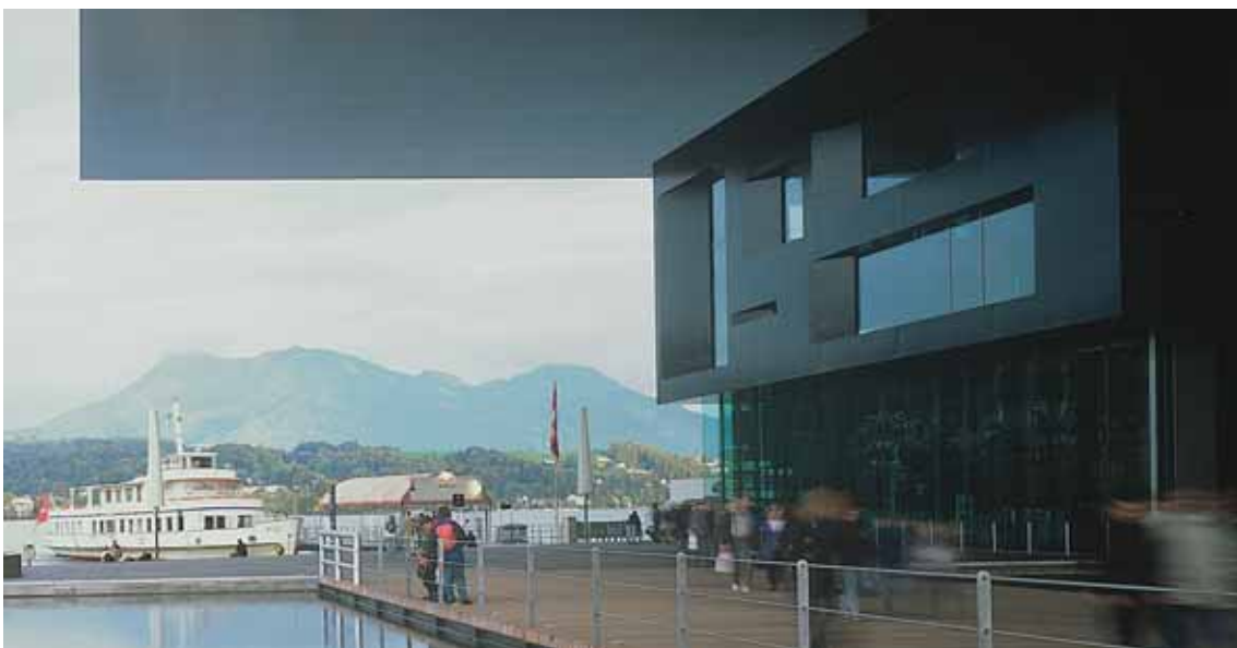
The Culture and Convention Centre Lucerne (KKL) – designed by renowned architect Jean Nouvel – is located in the city centre next to the main railway station, on the shores of Lake Lucerne.

A successful referendum in Switzerland in 2005 set in place a ban on the use of GMOs in agriculture. For this reason, the country represents an ideal platform for the 2009 meeting. The Culture and Convention Centre Lucerne (KKL) by Lake Lucerne is a suitable venue. About 400 participants from 30 European countries are expected to attend the gathering.